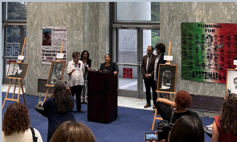
"Empty Graves, Empty Promises" reception in Rayburn House Office Building on 10th Anniversary of Ayotzinapa.