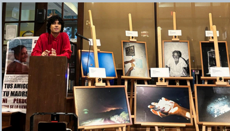
"Empty Graves, Empty Promises" event at BusBoys & Poets.