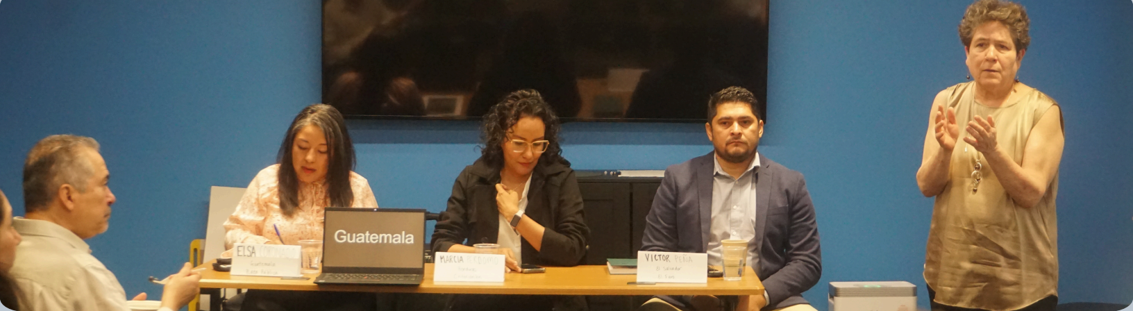
Public event hosted with Alianza Americas and Central American journalists at LAWG offices titled: "Climate Change & Frontline Journalism: The Path to Protections & Sustainable Development."