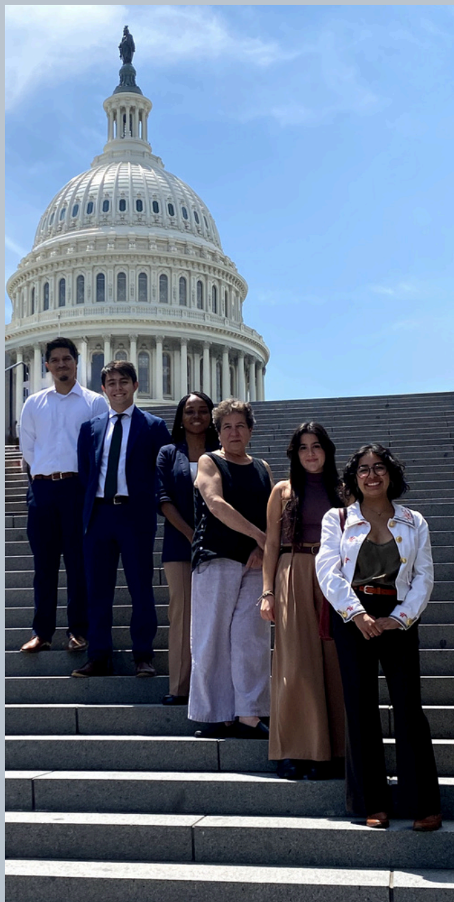
LAWG staff & Summer Advocacy Interns on the stairs outside the U.S. Capitol.