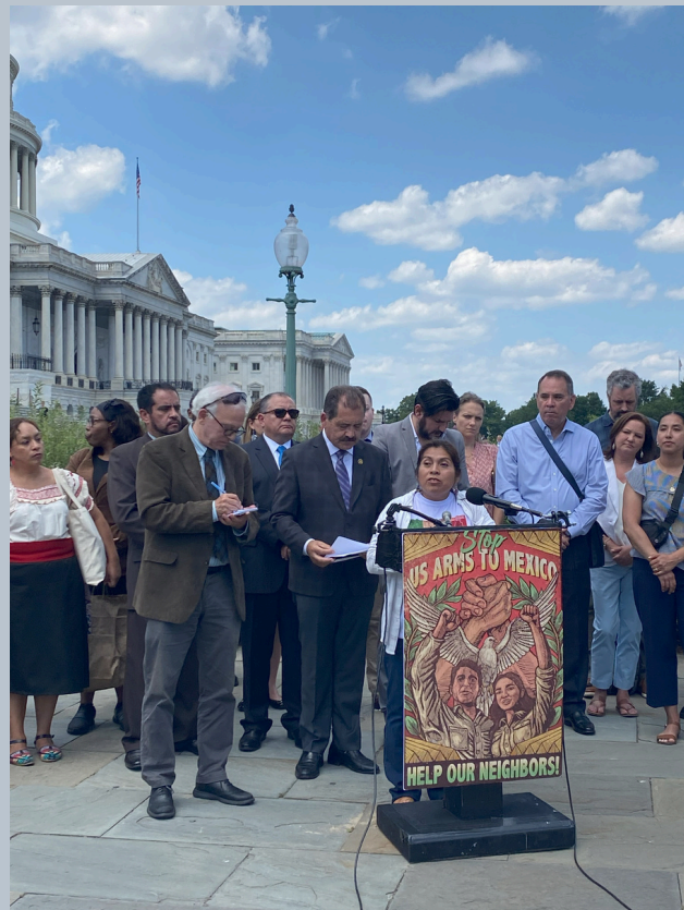
June press conference with Congressional Representatives and the Binational Agenda for Peace & Justice.