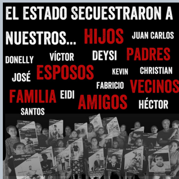
Graphic designed by the LAWG team for the Isla El Espíritu Santo social media campaign.