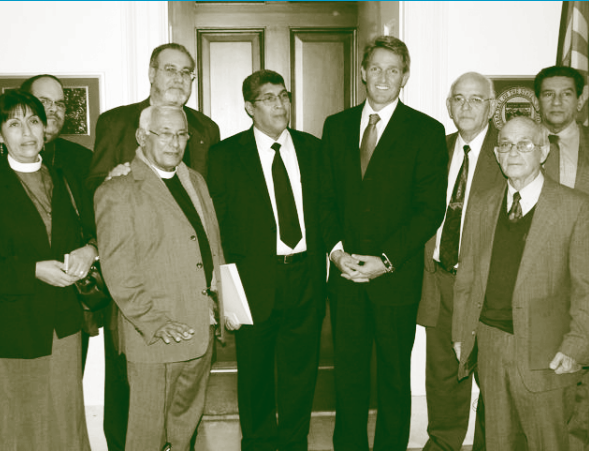
A group of Cuban pastors meet with Representative Jeff Flake to talk about the impact of the embargo on the Cuban religious community during a delegation organized by LAWGEF.