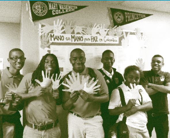
Students at Cesar Chavez High School in Washington, DC show off the artwork they made for Colombian communities during the Days of Prayer and Action.