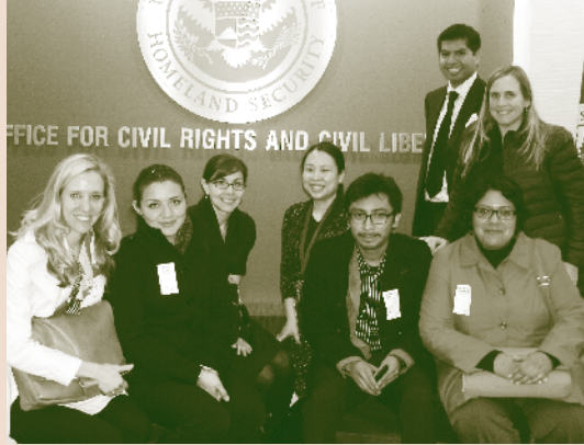
LAWG staff and a delegation of Mexican migrant rights defenders visit the Department of Homeland Security.

The Latin America Working Group (LAWG), a 501(c)4 nonprofit, carries out advocacy and grassroots education. The Latin America Working Group Education Fund (LAWGEF), a 501(c)3 nonprofit, sponsors educational events and produces publications. In the list of this year's activities, lobbying activities were carried out by the LAWG, and educational activities by the LAWGEF.