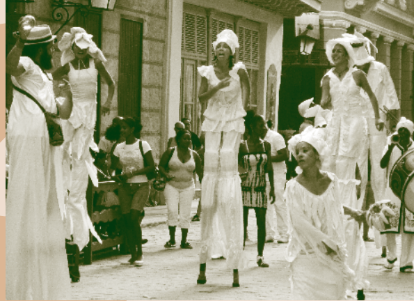
Dancers take to the streets in Old Havana, Cuba.