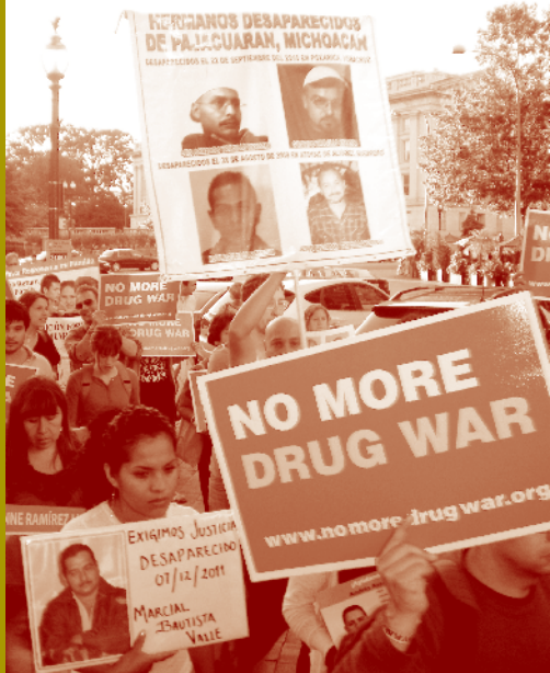
Caravaneros march through D.C. calling for justice for their murdered loved ones and an end to drug war violence.