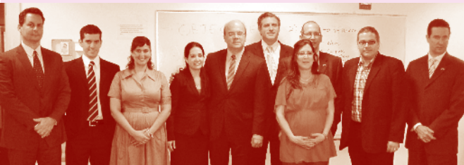
Members of CAFÉ, Cuban Americans for Engagement, with Rep. Jim McGovern.