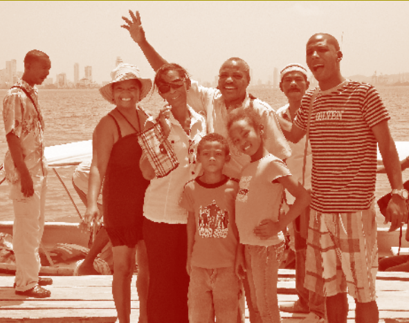
Members of Afro-Colombian community councils get ready to take us to the island of Tierra Bomba, Colombia.