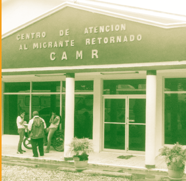
A Returned Migrant Center in San Pedro Sula as documented during a LAWG fact-finding trip to Honduras.