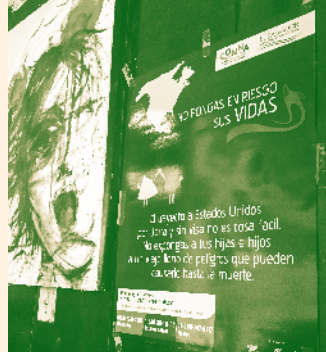
An ineffective poster campaign aimed at deterring child migration as seen during a fact-finding trip to El Salvador.