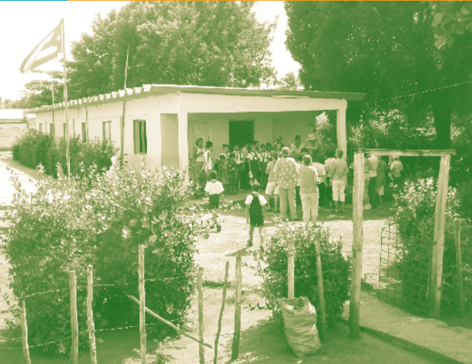
Visiting a rural school in Bayamo during an Eastern Cuba people-to-people trip led by LAWGEF and CubaPuentes.