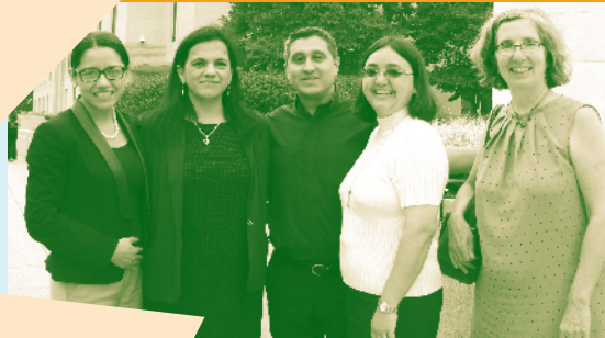
Migrant rights defenders from Guatemala and Honduras at the State Department.