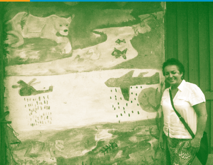
A Colombian human rights defender stands by a mural showing the impact of war in Putumayo, Colombia, including aerial fumigation and bombings.