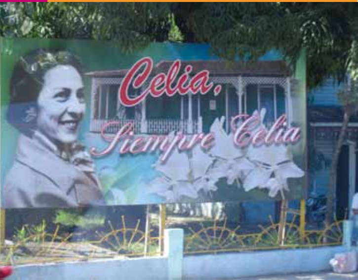
Billboard of Cuban revolutionary Celia Sánchez seen in the Granma Province of Cuba.