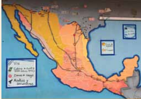
Mural at La 72 Hogar-Refugio for Migrants in Tenosique, Mexico.