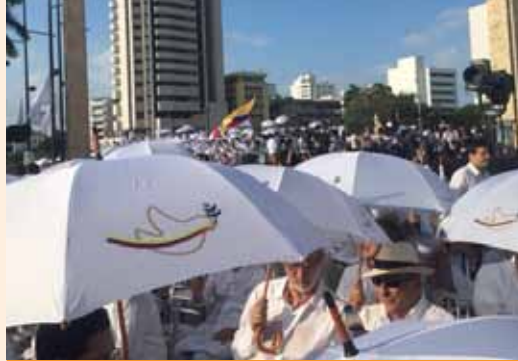
Crowds dressed in white gathered to witness the signing of the Colombia peace accords in Cartagena, Colombia.

The Latin America Working Group (LAWG), a 501(c)4 nonprofit, carries out advocacy and grassroots education. The Latin America Working Group Education Fund (LAWGEF), a 501(c)3 nonprofit, sponsors educational events and produces publications. In the list of this year's activities, lobbying activities were carried out by LAWG, and educational activities by LAWGEF.