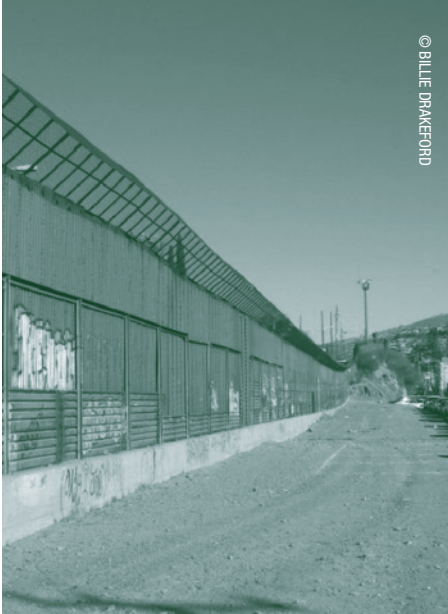
Barrier fence cutting through Nogales, a bi-national community on the U.S.-Mexico border.

was held in Canada as a response to the denial of U.S. visas to academics from Cuba to come to the United States to participate in the congress.