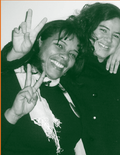
Colombian peace activists from Ruta Pacífica de las Mujeres at the LAWG office.

W hen you are struggling to make human rights matter in U.S. foreign policy, it's no surprise that often you are pushing a boulder up a hill. Or carrying water in a sieve.